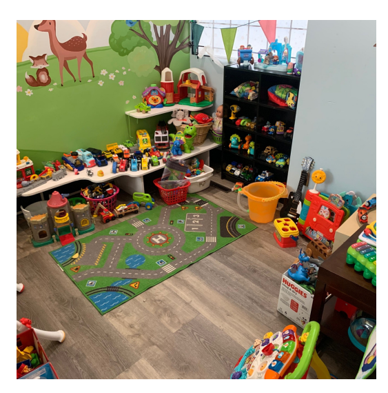
MRS toy area filled thanks to donations from our community