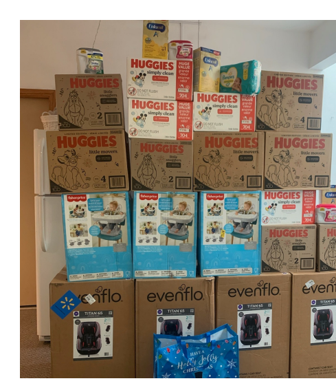
An amazing anonymous gift to our Tiny Treasures campaign